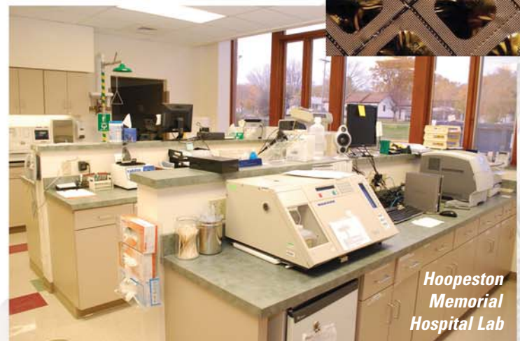
Hoopeston Memorial Hospital Lab