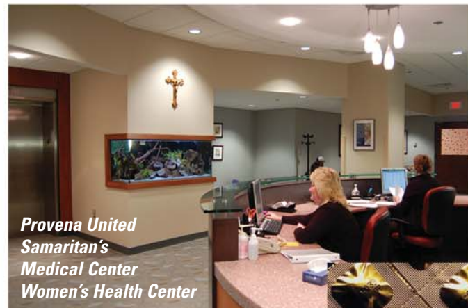
Provena United Samaritan's Medical Center Women's Health Center