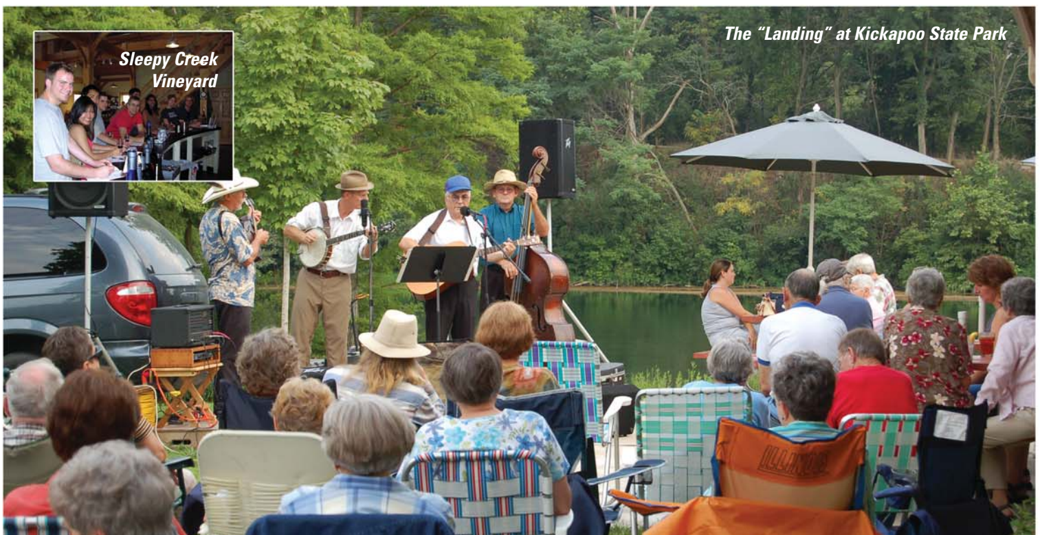
The “Landing” at Kickapoo State Park

When you want to slip away for a day, an evening or a weekend, you’ll find major highways that lead you directly to Indianapolis in a little over an hour to the east, to Chicago in just over two hours to the north, and to St. Louis about three hours to the south and west.