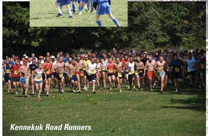
Kennekuk Road Runners