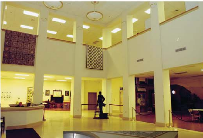
Vermilion County Museum

www.danvilleareainfo.com – another way to check out what is happening in Vermilion County.