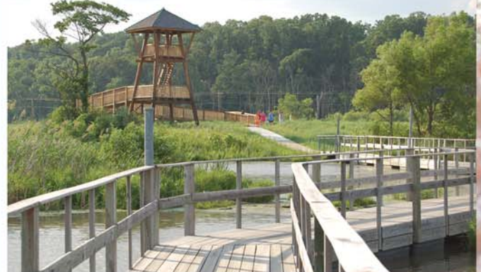
Heron County Park Wetlands Boardwalk