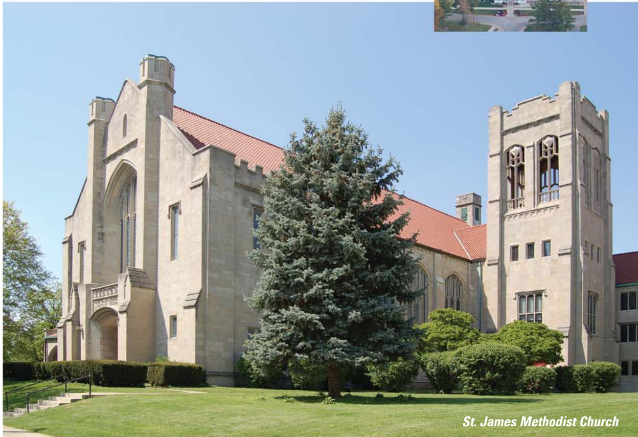
St. James Methodist Church

We understand that one of the most important decisions about where to locate is making sure your children and family are in the right place. In Vermilion County, you may be surprised to find that our system of education – from childcare and Pre-K, to 24 elementary schools and 12 high schools, to higher education and training – is award winning and remarkably extensive for a community of our size. We are nationally recognized for our collaborations at all educational levels. Employers are active partners with education to ensure our students are prepared for a global economy.