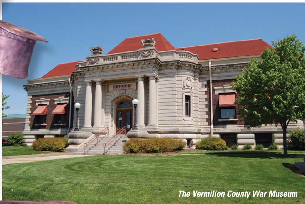
The Vermilion County War Museum

Vermilion County is located in East Central Illinois along the Illinois/Indiana border. With about 80,000 people, the county is home to some the most beautiful topography in the state. As the county seat and largest community, Danville's population of over 30,000 belies the fact that there is more happening here than meets the eye.