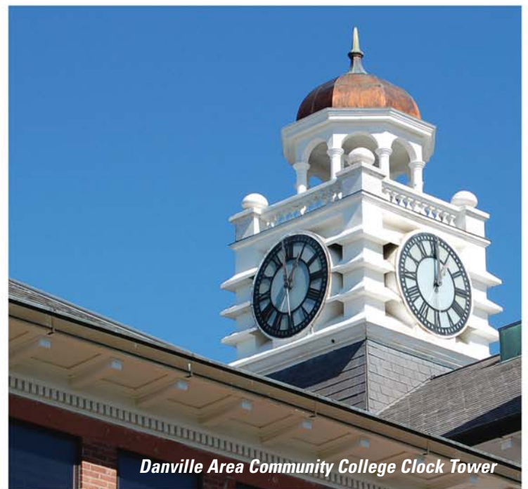
Danville Area Community College Clock Tower

The area has an astonishing number of churches and synagogues of all sizes, racial and ethnic mixes, and 58 different denominations. Whether you are looking for a smaller place to worship or prefer a church with well over a thousand people, Vermilion County offers active faith-based experiences for every season of life.