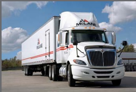
McLane Midwest Company, Inc. www.mclaneco.com

As a leading provider of grocery and foodservice supply chain solutions, McLane buys, sells, and delivers more than 40,000 consumer products – including foods, beverages, household items, automotive products and more- to thousands of retail locations across the U.S., including such familiar places as Wal-Mart, Target, CVS, 7-Eleven, Chevron-Texaco, Pizza Hut, Taco Bell and Circle K. The McLane Midwest Grocery division opened in Danville in 1993 and employs 700+ teammates who are committed to doing whatever it takes to make our customers successful. McLane is dedicated to living, working and investing to improve the communities we serve.